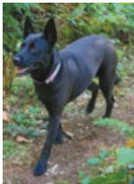
A Pit Bull Pen graduate!

this all-breed dog rescue is raising funds to expand their facility in Benton City by collecting gently used shoes. The shoes, of any size or style, will be sent to people worldwide who need them and the rescue will be repaid by the pound of shoes. It's a triple win: for the rescue, the recipient, and the donor who clears out closet space :). You can find dropoff boxes at area Subway and Costavida restaurants, other businesses, and in our parish lobby. For more information, visit www.thepitbullpen.org . Bless you!